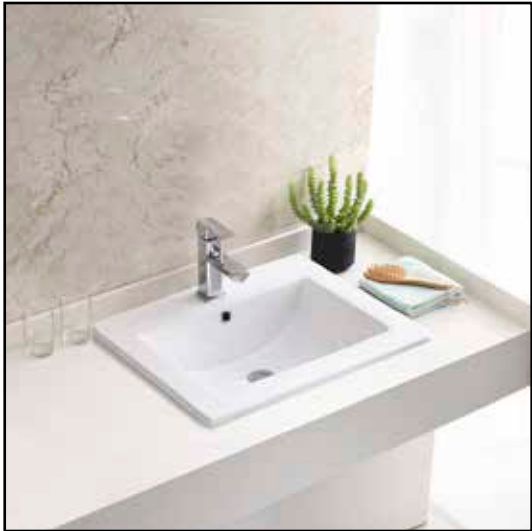
Installed Product Image

Please note: All porcelain sinks are fired at a very high temperature; final dimensions may vary slightly.