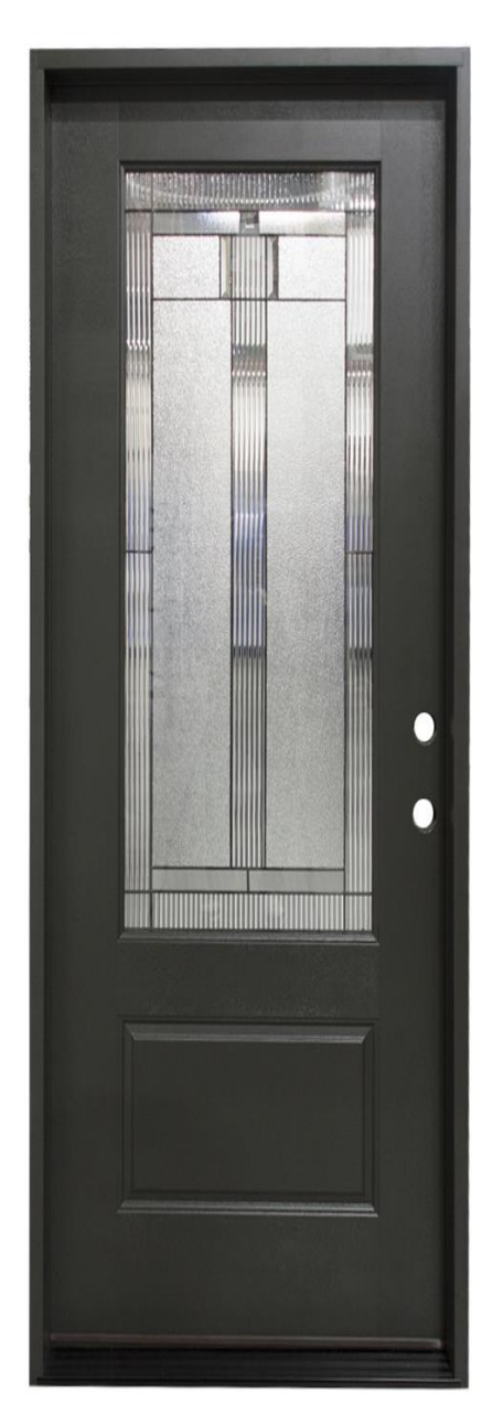
Add your text here.